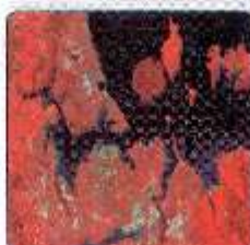
Auckland, NZ Nigeria Sat-X