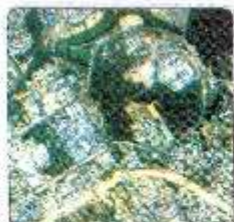
3 Arms Zone, Abuja Nigeria Sat-2